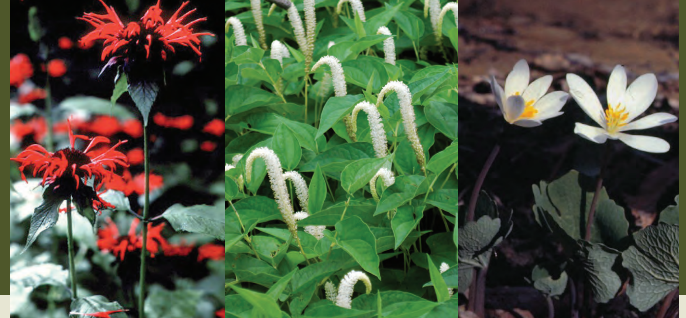
Above (left to right): Bee Balm, Lizard's Tail and Bloodroot; wildflower species found on the property

uller Field Station in the southern Honeoye Lake valley of the Finger Lakes Region provides field-based environmental education for academic programs, laboratory experience , community outreach, and the opportunity to participate in or observe research projects.