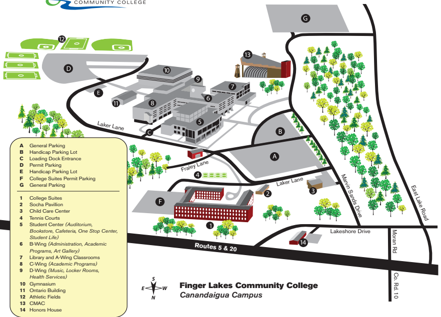
Finger Lakes Community College Canandaigua Campus